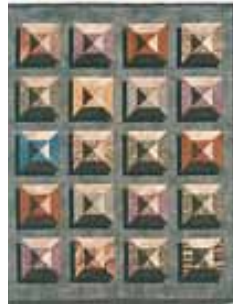
Emerald City Colleen Wise's Friday workshop class