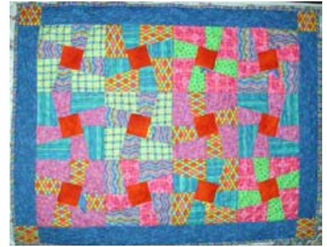
quilt by Susan Gertz - Middletown, Ohio

Twisted Sisters - Light and dark fabrics are stitched or "sistered" together, sliced, and recombined to make twisting pinwheel-type blocks that fit together with or without sashing strips. Other options include floating the pinwheels, folding 3-dimensional block centers, and experimenting with leftover chunks, bits, and pieces to create more quilts. You'll have a lot of choices.